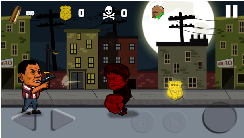
Figure 4: President Duterte shooting a criminal in Duterte: Fighting Crime 2.

player takes the role of President Rodrigo Duterte as he prowls the streets at night to fight criminals (Figure 4). Released during the Philippine presidential elections in 2016, the game is an endorsement of Duterte and his campaign against drugs and crime. The game depicts Duterte as a hero/vigilante who uses violence to quell crime. But in the context of rampant human rights violations and extrajudicial killings, the game becomes a propaganda tool to spread the violent ideology of the Philippine drug war (Cerda 2021).