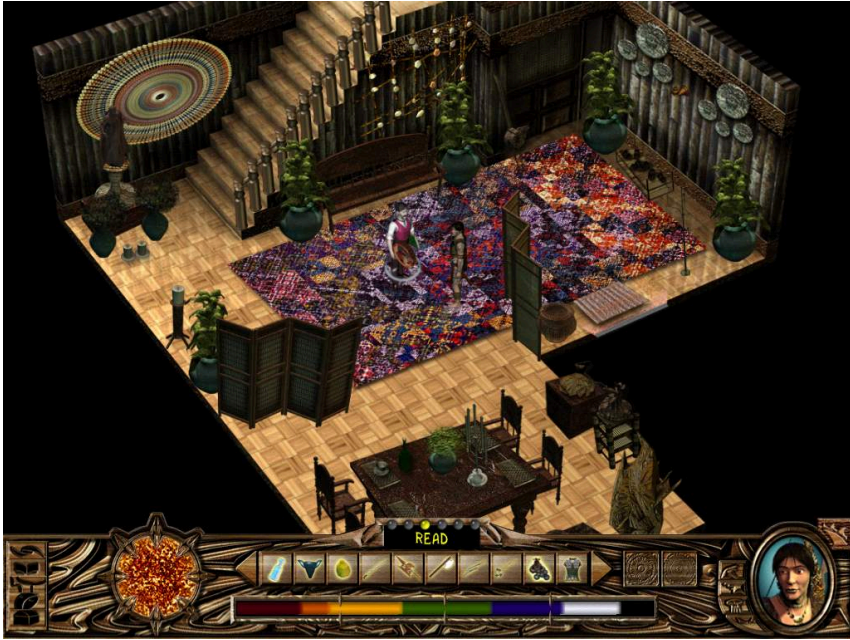
Figure 1: Agila, one of two playable characters, encounters a non-player character inside a house in Anito: Defend a Land Enraged (GameSpot n.d.).

The second game discussed in class also dealt with Philippine history and mythology. Nightfall: Escape is a first-person survival horror game set in the province of Ilocos, Philippines. The player takes on the role of Ara Cruz, a journalist who is investigating disappearances in an abandoned mansion. The game uses environmental puzzles to convey its nationalist imagery and historical references. Like Anito , players also encounter creatures inspired by Philippine mythology—the aswang , a man-eating creature; the manananggal , a woman who can transform into a winged creature during the night; the batibat , a creature that can cause sleep paralysis to its victims, and others. The player would have to unravel a mystery that dates back to 1896 during the time of the Philippine Revolution against Spain.