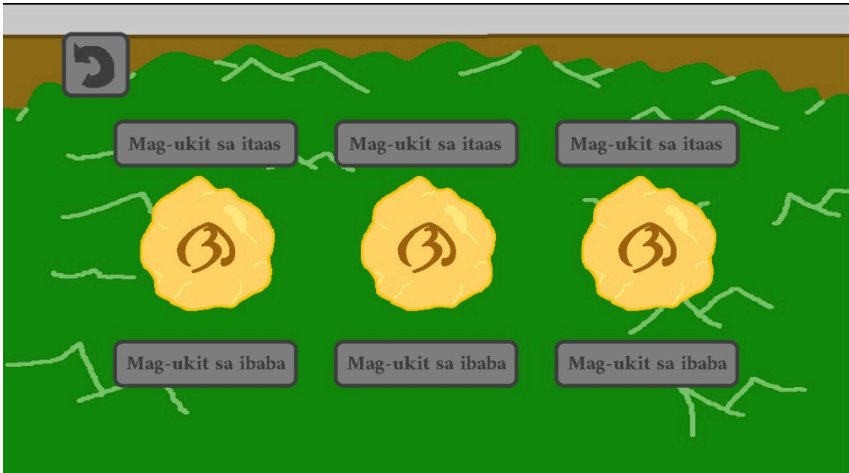
Figure 5: A puzzle in Alibatas how to write a kurlit/kudlit on a baybayin symbol (Margarejo, Nava, and Tangan 2019, 30).