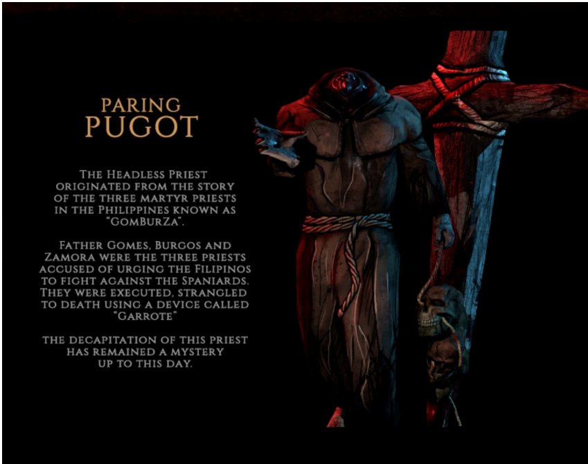
Figure 2: Bestiary entry for the paring pugot in Nightfall: Escape explaining the historical roots of the monster (screenshot by author).