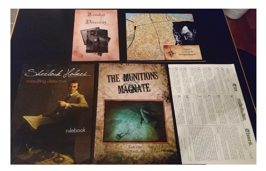
Figure 1. Base components for playing a Sherlock Holmes – Consulting Detective.