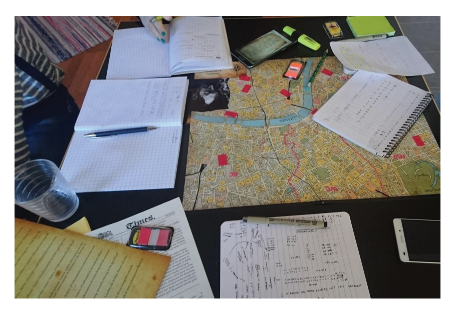
Figure 3. Gaming table during a case, presenting the map, in-game newspaper, and notes of four players trying to figure the meaning of a coded message.

SHCD achieves this by giving us a rich narrative, enabling collaboration, and by producing a sense of fun and achievements, even thru failure. Usually our cases are failures in some sense, even when we solve the case, as Holmes beats us by a large margin in the scoring phase. Other times, the game just bests us as we are trying to be too clever and end up going too deep in the clues. Refer to Figure 3, which showcases the typical setup during our sessions and also acts as an example of our glorious failure to understand what the game has been telling us.