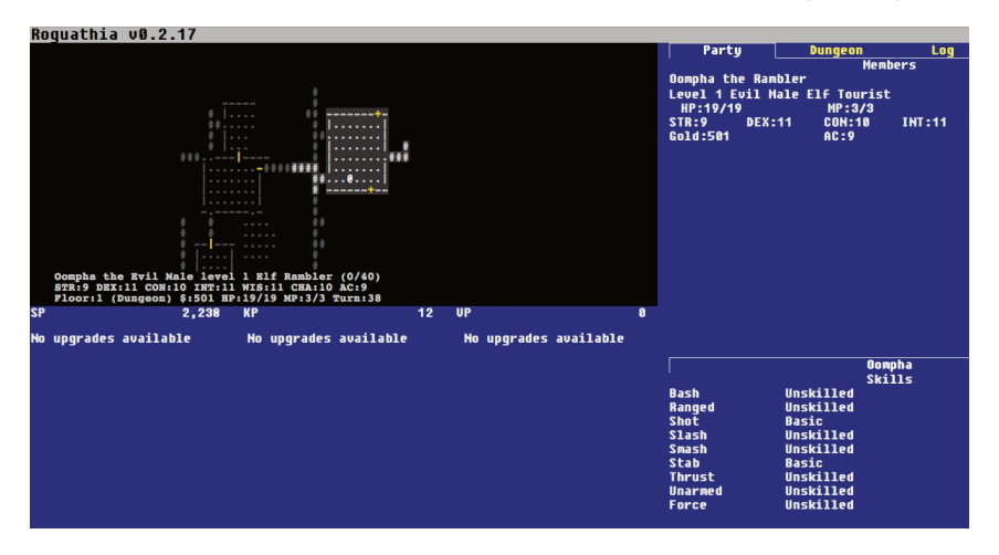
Figure 3: Rouguathia (2017)

The proliferation and increasing popularity of idle games seem to be pointing towards the normalisation process of the acceptance of the genre by a wider gaming community and what follows, the renegotiation of what counts as a game (Consalvo and DePaul 2013; Deterding 2016). Clearly, idle games have taken a visible place in the gaming landscape and moved from the satirical peripheries into the centre of what constitutes mainstream games. With idle games, the phenomenon of self-play has gained visibility.