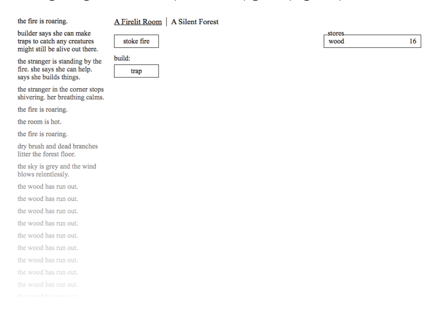
Figure 1: A Dark Room (2013)

This introductory auto-ethnographic passage describes a short gameplay session in A Dark Room (2013), an example of a relatively recent casual video game genre – an idle (incremental) game (Figure 1).