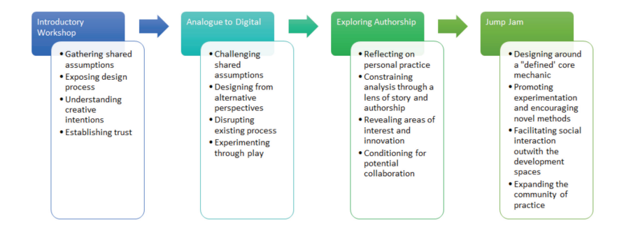
Figure 1: This figure details the goals of playful interaction within each event that aimed at each stage to support, develop and challenge innovation and creativity in a developing community of practice.