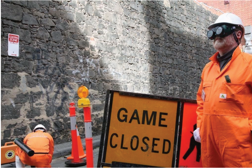
Figure 3. Urban codemakers in action during 2010 in Melbourne, Australia.

Generally speaking, in games it is possible for participants to key between three levels of being-in-the-world: Social, Operative or Character (SOC, see Conway & Trevillian (2015) for an in-depth overview), each providing a distinct ontological accent. In the Social, horizontal movement may occur between various social roles: worker, consumer, friend, mother et cetera, but play does not exist until one moves vertically, upkeying to the Operative World. In this mode of experience things take on a ludic accent; the material value of entities become secondary to their ludic value, their potential for play. In the Character World one assumes a persona assonant with the fictive realm of the game; the person speaks and acts entirely consonant with being-in-the-gameworld, not just as a player but as a role -player.