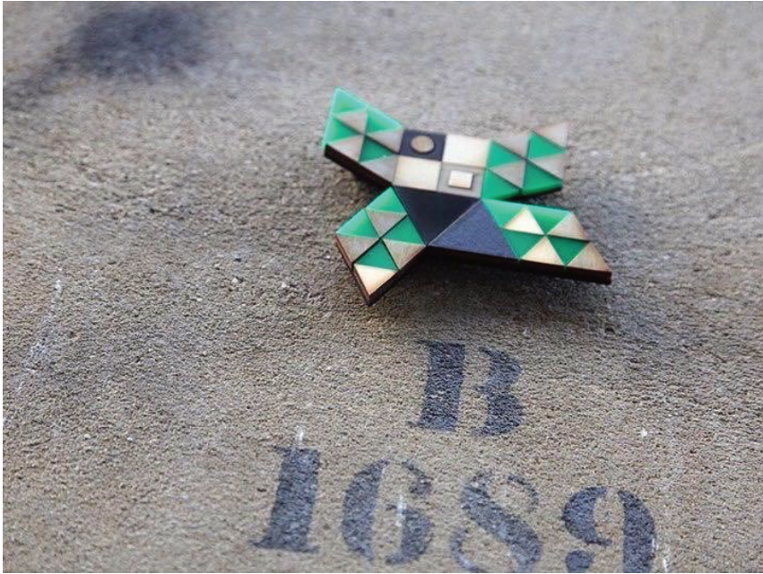
Figure 1. An urban code in play during 2016 in Melbourne, Australia.

experience is to open up the urban space as a site of potential, with play as the medium for experiencing other ways of being-in-the-city. Wayfinding in such design is not primarily a process of navigating from one place to the next, but catalysing new modes of experiencing urbanity.