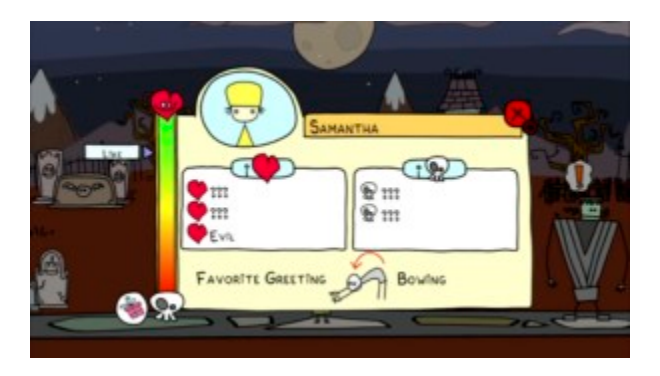
Figure 2: Character profile.

In addition to the mission-driven planets, the world map also features asteroids, each of which represents one of several dozen five-question personality quizzes. Each question is simple and indirect. Instead of asking whether you consider yourself extroverted or introverted, the game might ask which planet you want to visit or which alien you would most like to encounter. The choices are all crafted to represent distinct personality differences in relation to the underlying psychological concept. After completing each quiz, the game interprets the answers and tells the player about his or her personality in general terms. The next several pages of the results screen provide a question-by-question breakdown of the player's answers, elaborating on the issue at hand in each question and explaining more specifically what the player's choice reveals about himself or herself (see Figure 3).