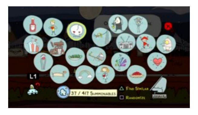
Figure 1: Summonables.