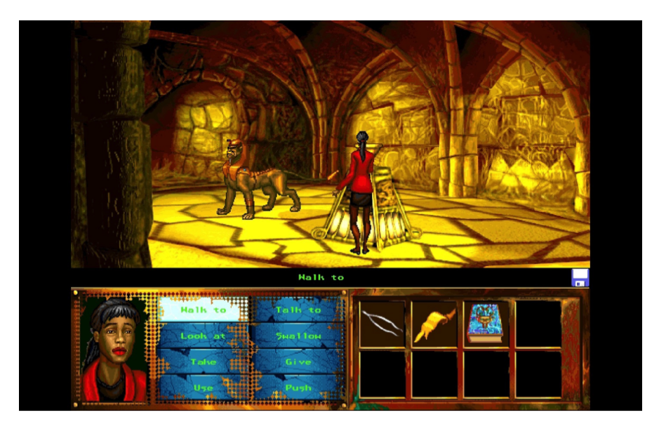
Figure 3. Ellen is in the yellow room with the yellow Sphinx, where she can collect the Holy Grail. She immediately runs out of the room unless you find a way to help her face her fear.

guards the Holy Grail, which you cannot collect until you find a way past the sphinx (and Ellen's fear) (see Figure 3).