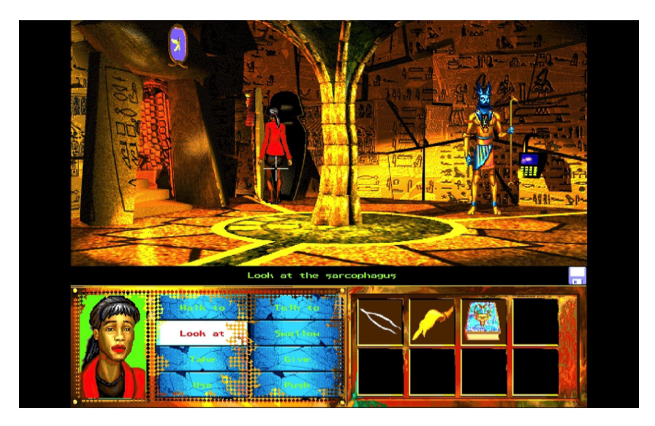
Figure 2. Ellen explores the hieroglyphics near a sarcophagus, while an Anubis-type robot stands guard.