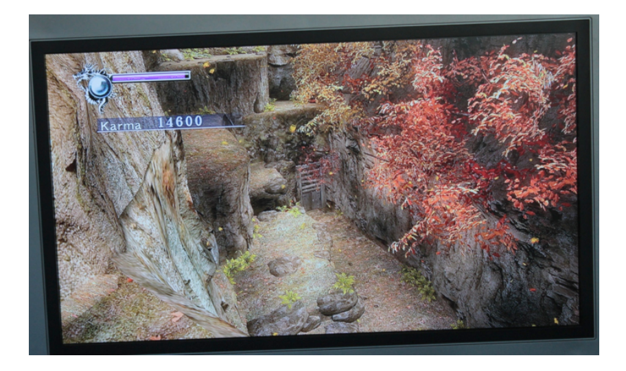
Figure 1: The Riverbed the player must escape from. No enemies! No chance of failure! ...But no instructions, either.

Ninja Gaiden Black is played on the Xbox or Xbox 360, so any input in the game is done via a gamepad. The gamepad has 11 buttons, a directional pad, and two analogue sticks, and pressing all of them in order to discover what happens on screen takes a small amount of time. Since the player knows all the buttons that could possibly affect the game space, she will most likely press them until she figures out how to proceed. In doing so, she will likely discover actions such as quick slashes, heavier attacks, and eventually, how to move around the space. Thus, these essential actions are 'figured out,' rather than taught through traditional instruction. This is more engaging for the player as well, as there is a sense of discovery to these actions.