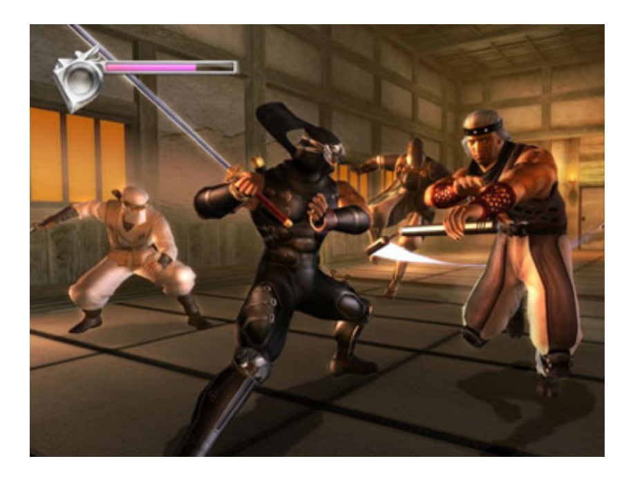
Figure 3: Combat with Ninjas that mimic the player make the player very aware of her own strengths and weaknesses, lessons that can then be used to fight all sorts of enemies.

Finally, the enemy ninjas themselves use the exact same moves that the player performs. They can jump, dodge, and slash using the same moves that the player does, albeit a bit more basic Thus, if the player does not already know how to, say, jump off of a wall in order to dodge a blow, she will see the enemy do it, and realize that they could do that as well. (Similarly, she will know when dodging isn't a good idea, because she will catch a ninja leaving itself open to attack, and use it to kill her enemy. That's a lesson that's hard to forget!)