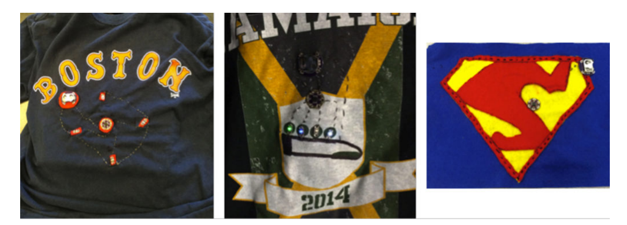
Figure 4. Examples of students' LilyTiny projects.