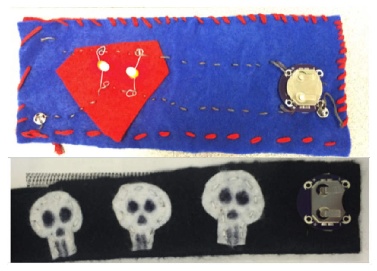
Figure 3. Examples of students' bracelet projects.