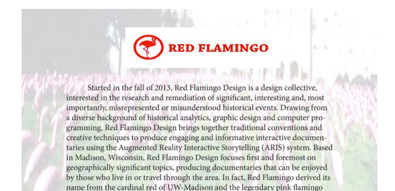
Figure 2. Red Flamingo's team introduction.