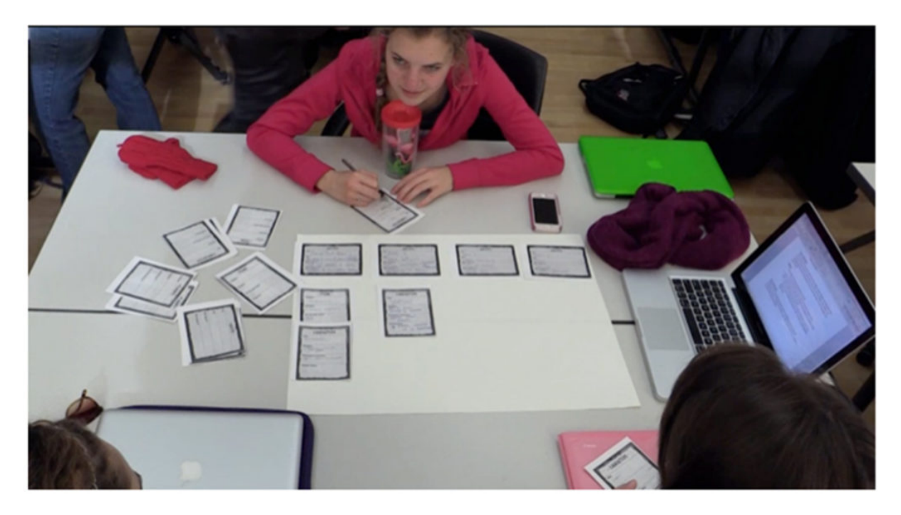
Figure 3. Storyboarding with narrative elements.

For the third class (their third week building in ARIS), students came to class with the game already partially built according to the narrative trajectory of the storyboards they had created the week before. The elements (items, characters, plaques) had all been placed on the map, and teams began to bring in media files (videos, music, images, etc.) to supplement the experience design of their games. During this session, the software trainer introduced the students to requirements, which allows them to sequence their game elements in a specific order. The teams spent about 25 minutes of class time working on requirements within their newly minted games—with technical support nearby in case they needed assistance with advanced requirements.