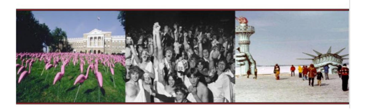
Figure 6. Front page of Red Flamingo's proposal, showing a lighter tone.