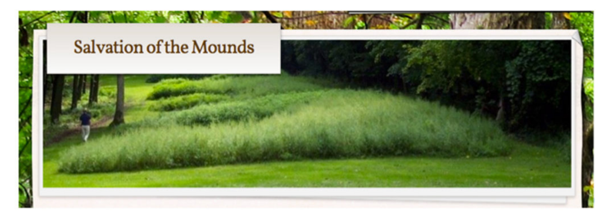
Figure 5. The natural environment of the effigy mounds is reflected in the design choices of the Salvation of the Mounds team.