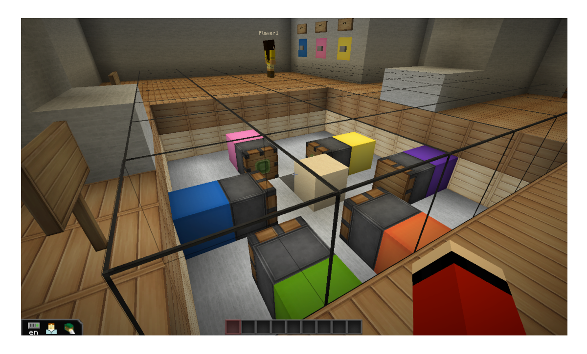
Figure 1. Example of a puzzle in the experiment from one of the participant's perspectives. The other participant's character (labeled as Player 1) can be seen in the top center of the figure.

Figure 1 shows an example of one of these puzzles. Here, the two participants have to work together to move a block to a particular location. Pressing the colored buttons on the wall will move the block in different directions. In this case, the participant has to tell their partner to press the blue , pink , and yellow buttons in sequence to move the block to the correct location. After they do this, the door will open and they can proceed to the next puzzle. Other filler trials included games where participants needed to complete a maze, fire an arrow at a target, or guide a minecart to a particular location. Critically, each of these puzzles needed to be solved cooperatively by having the participants exchange information with each other, creating situations that allowed for natural conversation.