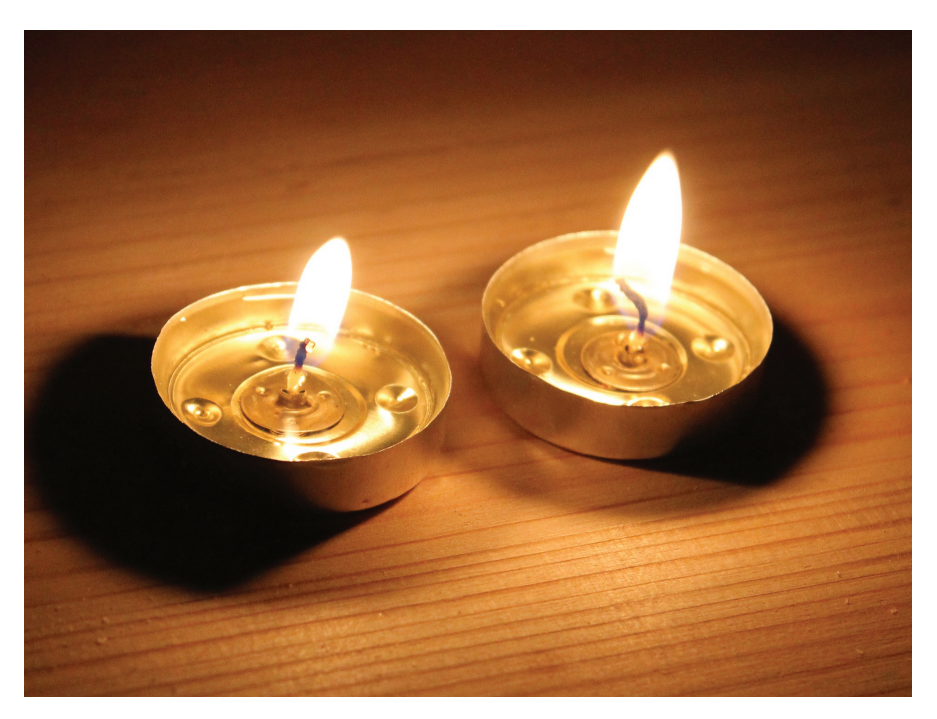
Sabbath Candles, a cornerstone of Jewish practice.

Eclipses are funny things. They stop the world, and we all look up together, watching that constant sun slowly disappear before our very eyes. And together, we wonder, for just a moment, if the light will ever come back.