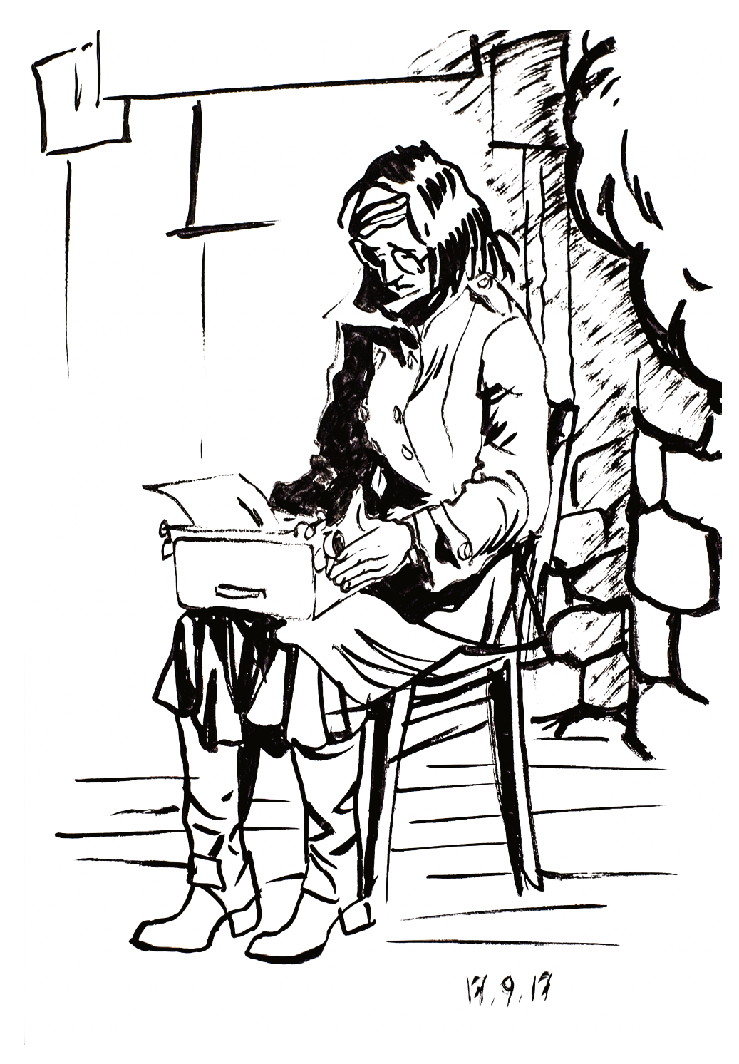
Freak Show larp documentation drawing by Kaspar Tamsalu.