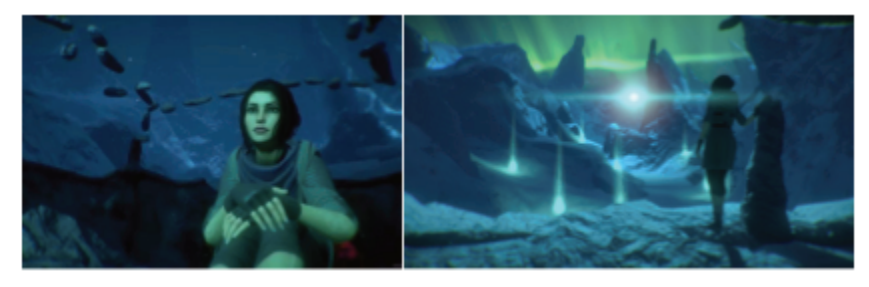
Figure 1. Zoe in storytime.

themed conspiracy spurring the Stark-based plot forward. Enter Dreamfall: Chapters , which picks up the thread in the shoes of Zoe in the eerie calm of Storytime.