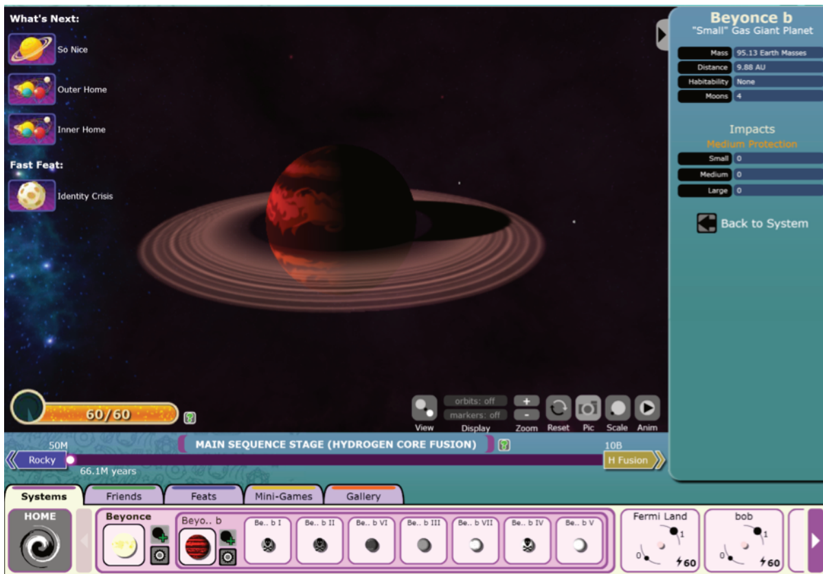
Figure 1: Main game screen, showing a ringed planet. Ring gaps are generated programmatically based on the locations of the moons (visible at the upper right of the rings).