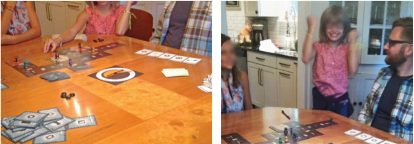
Figure 4. Video capture from a family playing a version of the Energy Monsters game. Right: Celebrating after a successful spin of the energy spinner

Here we reflect on some of the strengths and weaknesses of our current game design using examples from a session conducted in the fall of 2015. This family included a father, two daughters, and a son. The families played the game on two separate occasions for roughly an hour and a half each session. This family played a slightly different version of the game than described above. In this version, two teams (monsters versus heroes) competed against one another.