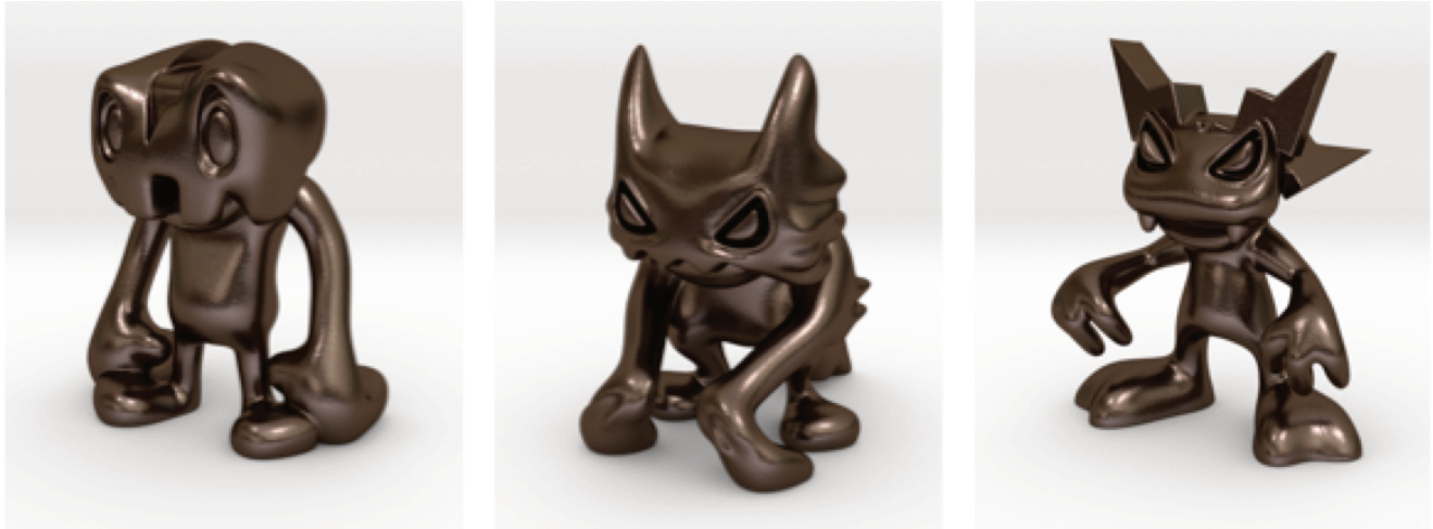
Figure 1: Monster figures (Bonehead, Wattwolf, & Ampire). Design by Eric Uchalik (euchalik.com).

To win the game, the energy heroes must band together and expel the energy monsters from their home before it's too late. On each turn, the monsters find a devious new way to waste energy. As the energy level rises, your electricity bill gets more expensive and the monsters become stronger. If the monsters ever get the power level above 3,000 watts or the heroes run out of money, the game is lost. The heroes work together to turn off appliances and electronics while avoiding the monsters.