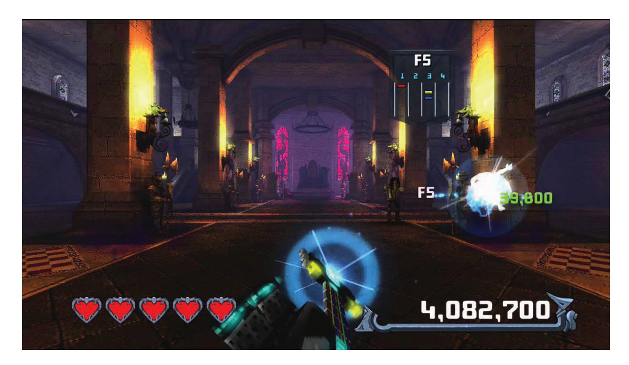
Figure 1: Screenshot from Return to Castle Chordead Mini-Game

through a castle level and must play the F5 chord to take down a monster before the monster reaches the player. In the figure, which is in first-person perspective, one notices the neck of the guitar in the lower center of the screen, which is metaphorically the gun used in many light-rail shooters. One also notices that the F5 chord is placed up top and to the right, with a diagram displaying how to play the chord. This diagram is a depiction of the strings and frets needed to strum the correct chord, this diagrammatic representation is used throughout Rocksmith 2014 to discuss what frets and strings to hold to play a specific chord.