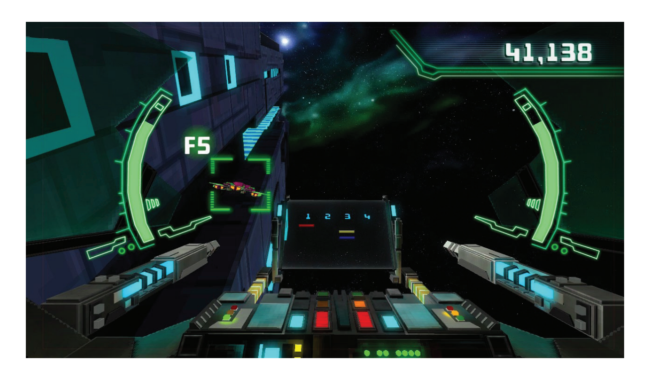
Figure 2: Screenshot from Star Chords Mini-Game

In looking at the two games, I not only prefer Return to Castle Chordead over Star Chords because it has a stronger narrative, but I also prefer it for the fact that you can practice a certain set of chords, as the game's short story on rails allows you to progress through the entire story in about 15 minutes, providing a checkpoint system that is completely missing in Star Chords , where you must always begin your spaceship journey from the beginning. Using the MDA model to analyze both games (Hunicke, LeBlanc, & Zubek, 2004) and applying learning goals to that framework, both games exhibit the same learning goal and mechanic of matching enemies to a chord. Nonetheless, the dynamic and aesthetics of each game differ, creating what feels like a different experience in both. This caused me to alternate between the games. Like for example on the 48th day, after playing Star Chords for a while and not passing my high score, I got tired of playing the game yet still wanted to practice chords, so I switched to playing Return to Castle Chordead . While this type of variety is not always feasible in games due to the amount of resources needed to produce both games, it is an important piece to understand the role that aesthetic pieces like story (Jimenez, 2014) and dynamics can have in creating experiences that feel fresh for gamers, yet still allow them to work towards the learning goals set out by the development team.