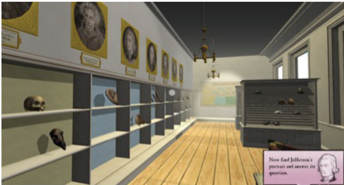
Figure 1: The virtual environment is modeled after Charles W. Peale's Museum.

Solving the Incognitum is a first-person point-and-click 3D interactive learning environment for teaching the relationships between geological time and fossil records. In an environment based on the Charles W. Peale's Museum of Art and Science, the largest natural history museum in the U.S. in the early 19th Century, the player can interact with museum exhibits including fossils, minerals, strata deposits, and portraits of renowned historical figures related to the exhibits (Figure 1). By correctly answering questions related to these exhibits, the player can eventually assemble the crown jewel of the historical museum — the skeleton of the mastodon exhumed by a scientific team led by Peale in 1801. Overall, the educational goal of the game is to teach concepts related to (a) Law of Superposition, (b) Geological Time, and (c) Mastodon Life. After a brief tutorial, the player can explore the virtual space, examine different exhibits and answer questions about them.