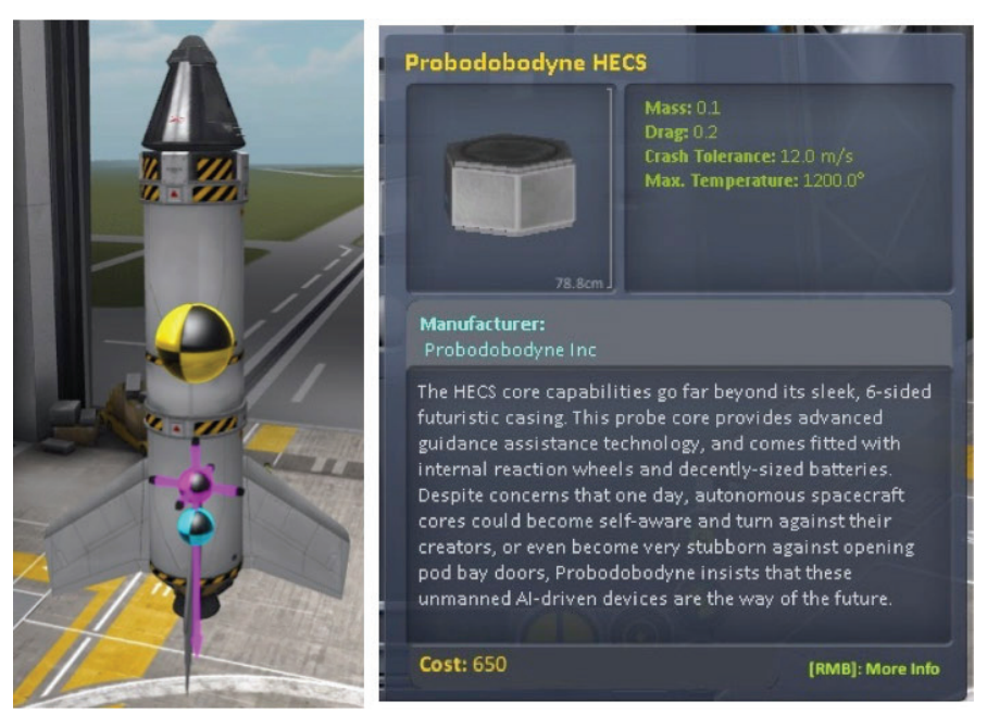
Figure 4: A visualization of the center of mass, thrust and lift on a rocket (left) and detailed information about the properties which combine to create those (right).

The details span the physics, the library of parts, and the community that surrounds KSP . One can read up on the different aerodynamic properties, tolerances and propulsion properties of the available components. These are not mere labels, but instead are accounted for (Figure 4) in the simulation. There are supporting tools to help visualize how these properties combine to create a center of mass, thrust and lift.