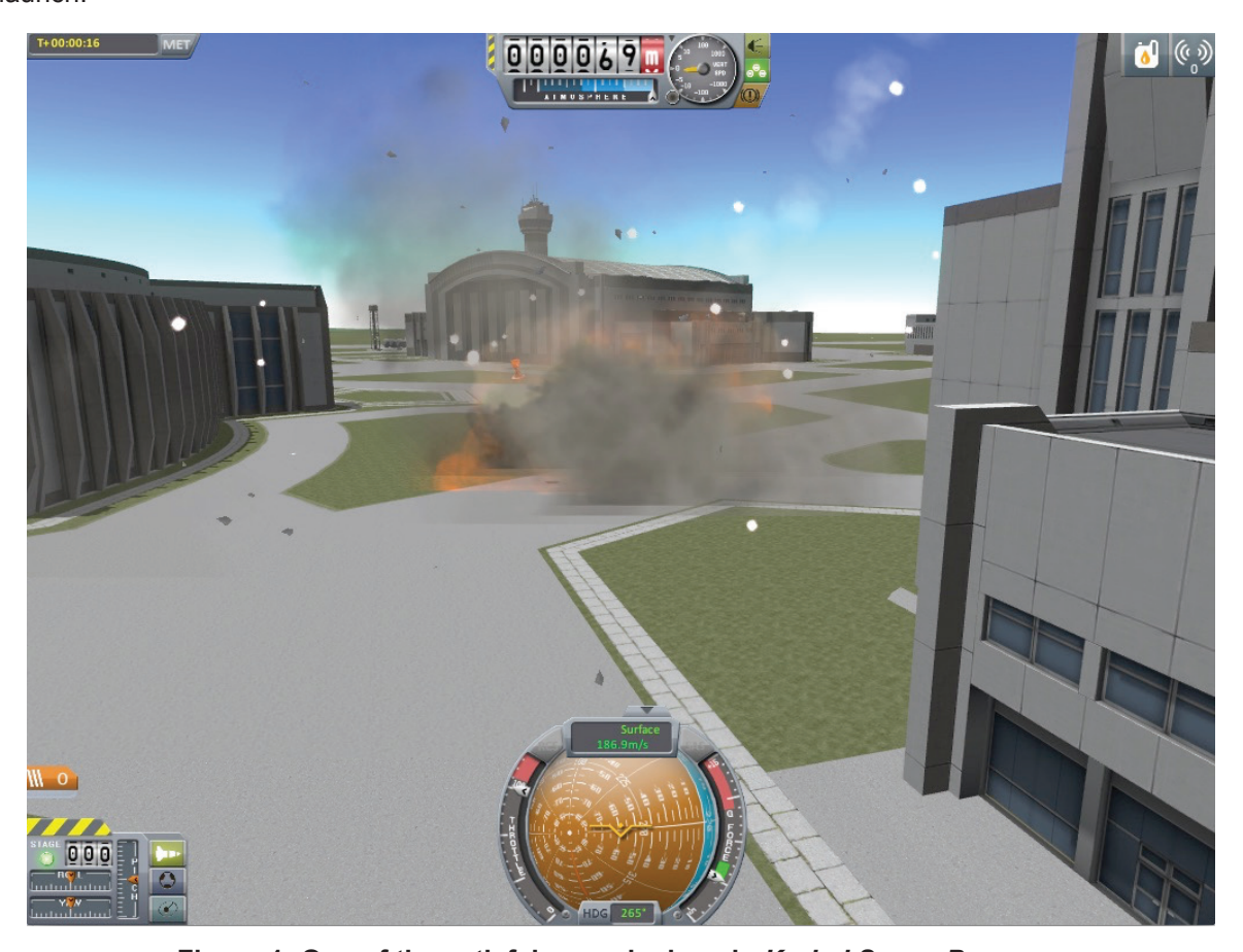
Figure 1: One of the satisfying explosions in Kerbal Space Program.

While many games might encourage players to start in a more bounded mode that provides additional structure, leaving the sandbox for later, KSP has such a steep learning curve that such constraints are not necessary in the initial phases. Unlimited resources and parts still inevitably lead to a rocket that at best explodes (Figure 1) shortly after launch.