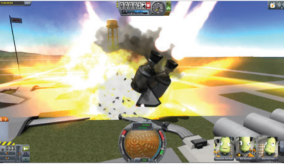
Figure 5. Some of our failed attempts in KSP where rockets were too heavy (left) or not stable enough (right).