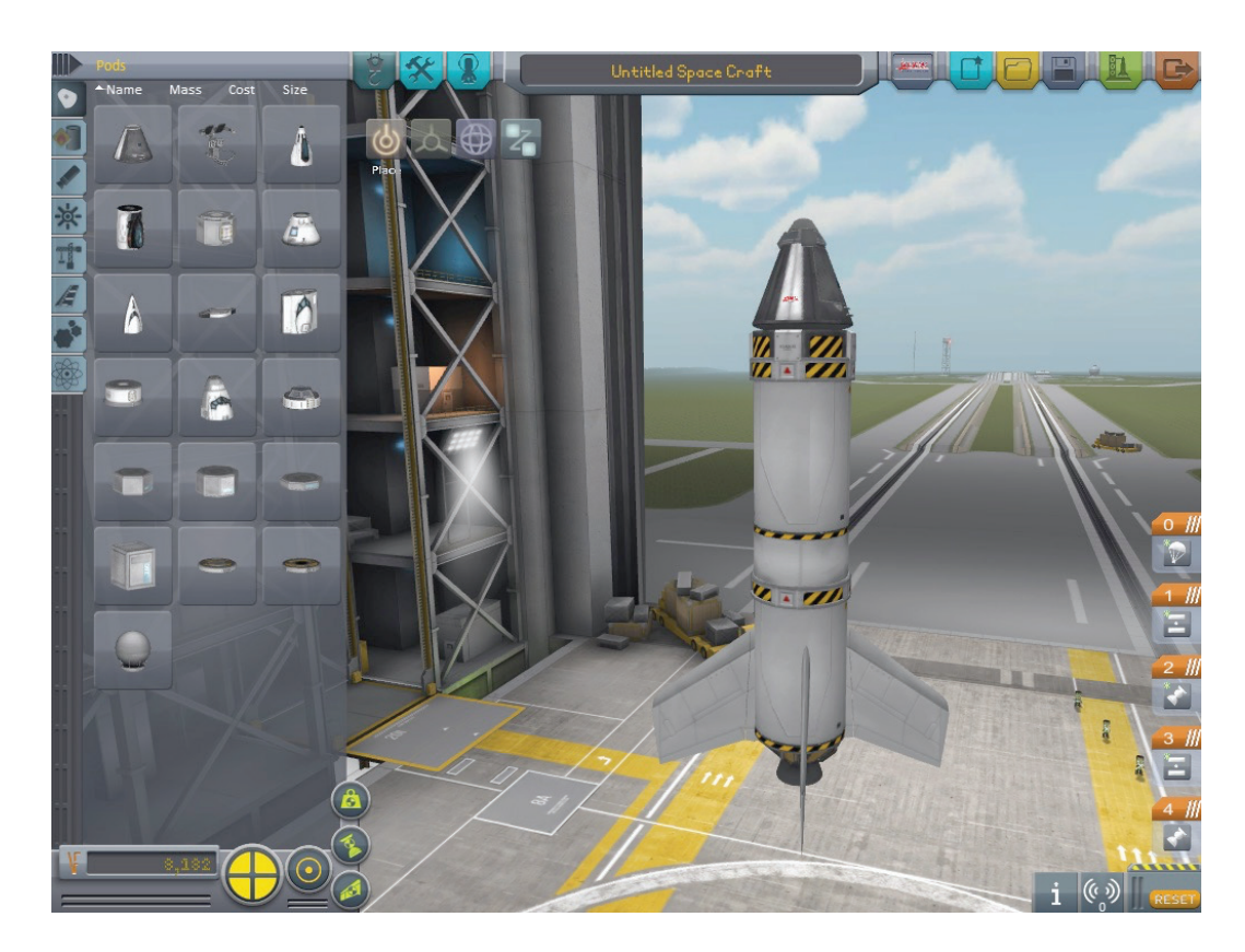
Figure 3: A partially assembled rocket and some of the available parts.

And that is good, because there is a lot of failure in KSP . The game has an extremely steep learning curve. It turns out that building, launching, piloting and navigating a spacecraft is rocket science, and KSP makes that very clear. An initial challenge might be to build a simple rocket that can fly up a little into the atmosphere, eject the control module with the pilot inside and land safely back on earth. But there are many points of failure in such a plan (Figure 3). Are the fuel tanks heavier than you have lifting power for? Did you remember to put a parachute on top and decouplers between the stages? Are the stages in the correct order? Are the engines the right match for the fuel tanks and sources? Are the aerodynamics sufficient to keep the rocket stable? There are many choices, which make the resulting rockets deeply personal, and equally as challenging to get it right.