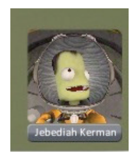
Figure 2: A frightened Kerbal pilot.

And that is good, because there is a lot of failure in KSP . The game has an extremely steep learning curve. It turns out that building, launching, piloting and navigating a spacecraft is rocket science, and KSP makes that very clear. An initial challenge might be to build a simple rocket that can fly up a little into the atmosphere, eject the control module with the pilot inside and land safely back on earth. But there are many points of failure in such a plan (Figure 3). Are the fuel tanks heavier than you have lifting power for? Did you remember to put a parachute on top and decouplers between the stages? Are the stages in the correct order? Are the engines the right match for the fuel tanks and sources? Are the aerodynamics sufficient to keep the rocket stable? There are many choices, which make the resulting rockets deeply personal, and equally as challenging to get it right.