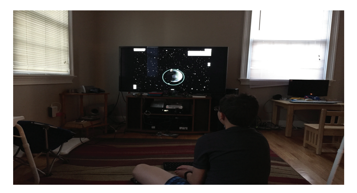
Figure 5. A successful orbit in KSP is shown looping entirely around the planet.

This marked an important milestone and of course posed the next question – how do we get our Kerbals back? This process of design, build, and test (along with research in various forms) is a great way to interact and even allows for differential time spent on the game while both of us still feel a sense of progress and ownership.