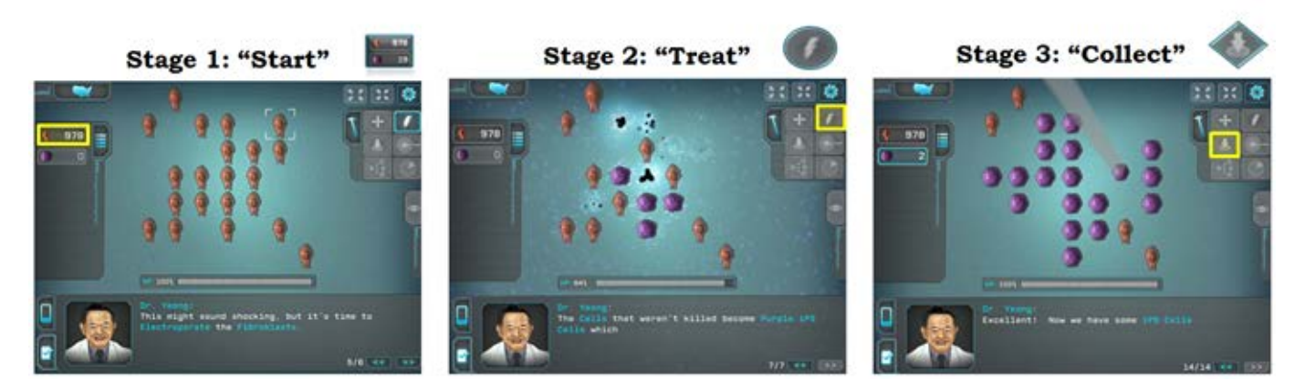
Figure 2: Progenitor X Game-flow Design

Semantic template. The semantic template defines conceptual windows of interest in the game that represent key moments of learning. It is designed around the intersection of the content model with the game-flow design. The key question for semantic template design is: of all the clicks that players make in the game, which ones indicate learning? The semantic template represents a hypothesis about which in-game actions can generate interesting evidence of learning.