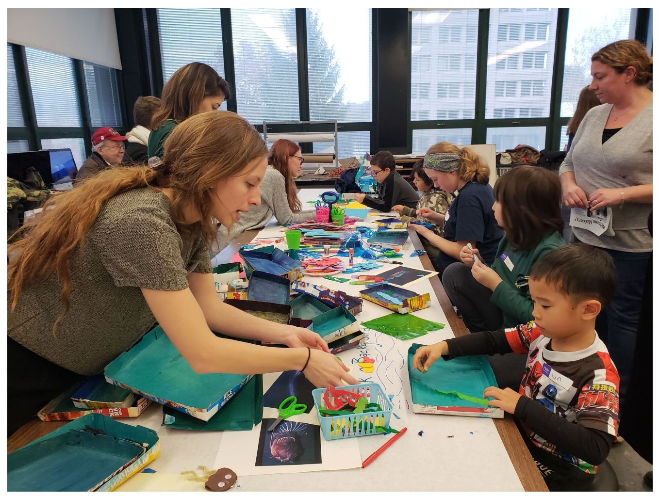
Figure 3. A Family Maker Day activity inspired by research on phosphorescent fish, using simple circuits, LEDs, and pipe cleaners combined with a variety of other art materials.