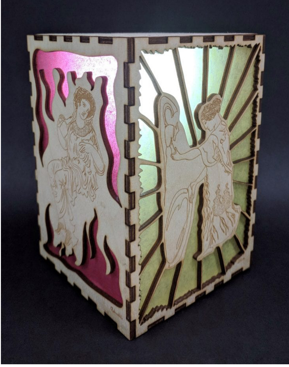
Figure 1. This is an example of student work: a laser-cut lantern that incorporated LEDs programmed with Arduino.