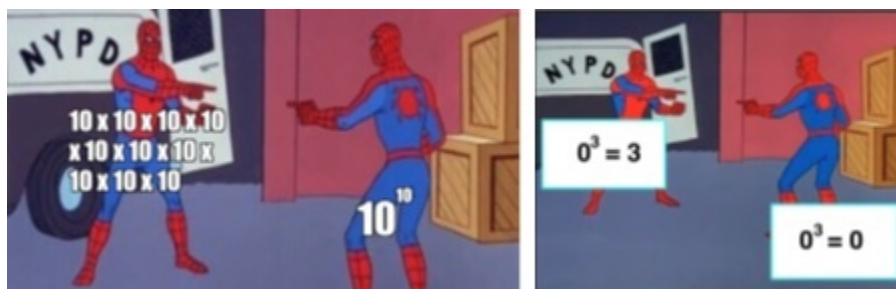
Figure 7. The students’ Spidermen.

In this activity the use of memes, instead of traditional exercises, positively challenged learners, allowing each student to participate and contribute according to his or her personal mathematical expertise. This constructive climate fostered metacognitive processes that enabled assessing the basic knowledge about powers (see Figure 7, left), and in some cases elicited misconception (see Figure 7, right).