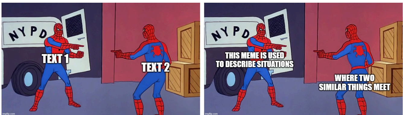
Figure 4. Structural meaning (left) and social meaning (right) of the Spiderman meme.

This study is therefore designed to address the following questions: