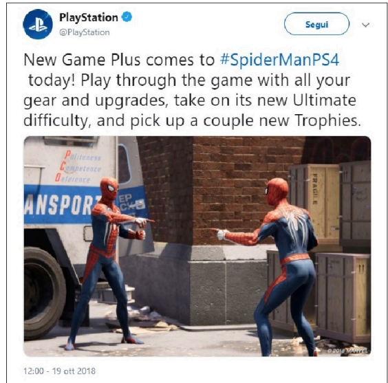
Figure 3. Spiderman pointing at Spiderman meme-inspired re-creations.

All these evidences attest how deeply this meme has been interiorized by web users, who easily recognize and decode it even when it is taken out of context. From the point of view of mathematical reasoning, the metaphorical meeting of two similar things described by this meme resonates with the idea of the commonality of meanings across different semiotic representations of mathematical objects, whose recognition and understanding are acknowledged as cornerstones of an effective mathematical activity aiming beyond the mere memorization of facts and procedures (Duval, 2006; Etkind, Kenett, & Shafir, 2015). In fact, this template is widely exploited within online communities exchanging memes on mathematical subjects, where its puzzle effect (the template implies that the two things are connected, but it is up to the viewer to unravel why) challenges users, providing openings for spontaneous learning.