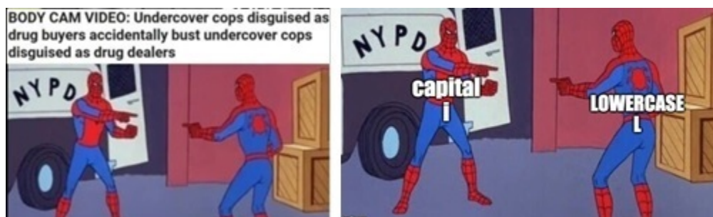
Figure 2. Spiderman pointing at Spiderman meme examples.

In the process of meme genesis, whose mechanisms lie far beyond the scope of this paper, the Spiderman pointing at Spiderman template acquired the metaphorical meaning of two similar things meeting (see KnowYourMeme, https://knowyourmeme.com/ , the Internet meme database). In this sense it triggered a wide range of modifications and personalizations, all aimed at capturing the humorous side of the acknowledged metaphor, with the personalized caption either in a white strip above the image (see Figure 2, left) or superimposed on the two Spiderman figures (Figure 2, right).