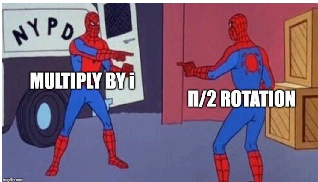
Figure 6. The teacher's Spiderman.

This example focuses on a meme I created that was proposed in the class after the students’ meme-creation activity, in a peer-based exchange of memetic productions between students and educators. Students received printed worksheets with the meme in Figure 6 (among others) and were asked to explain the specialized partial meanings; teacher and author were present. All students turned in correct answers for this meme, with the exception of one student who wrote, “I have no idea.” This student, while filling in the handout, had asked me for support in decoding the meme, and some effort was needed to persuade him that he could simply leave it blank or write that he did not know the answer. He was convinced only after being reassured that he would eventually receive the requested explanation during the discussion. This behavior is diametrically opposite to what commonly happens in a math class, where students, unfortunately, rarely care for explanations of unsolved questions: I believe that this can be interpreted as evidence of the connected learning features of interest cultivation and challenge associated with the meme.