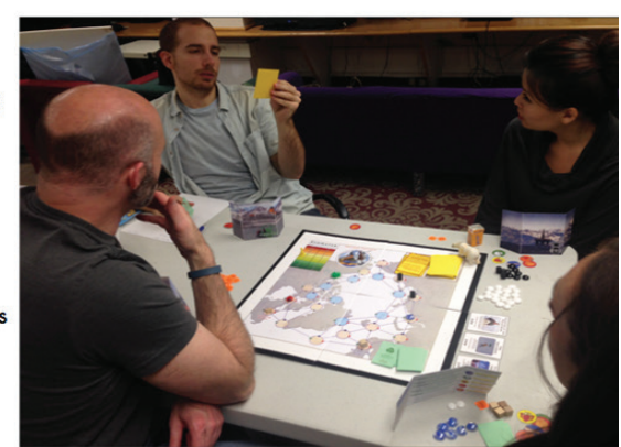
Figure 1: Resolving an Event in Arctic Saga