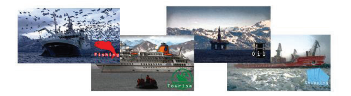
Figure 2: Initial proofs of stakeholder character screens