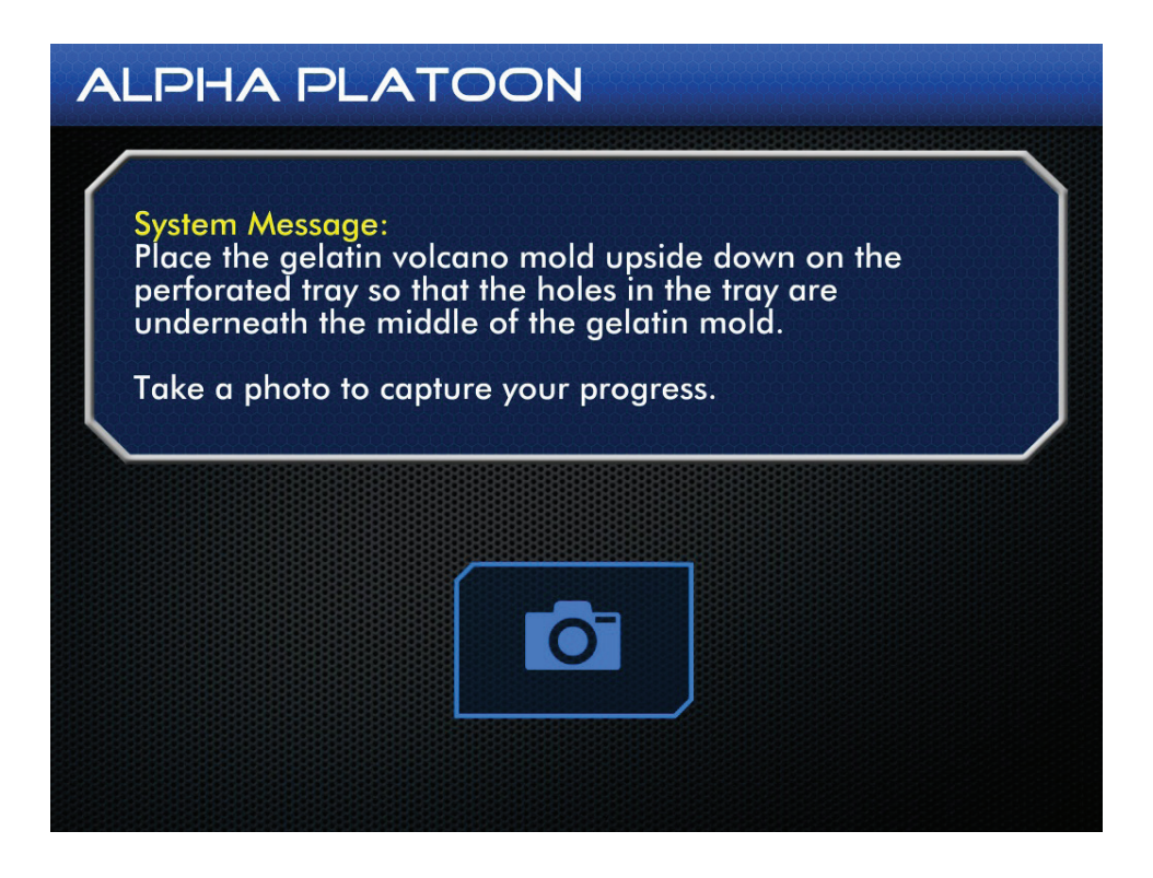
Figure 5: Sample photo screen.