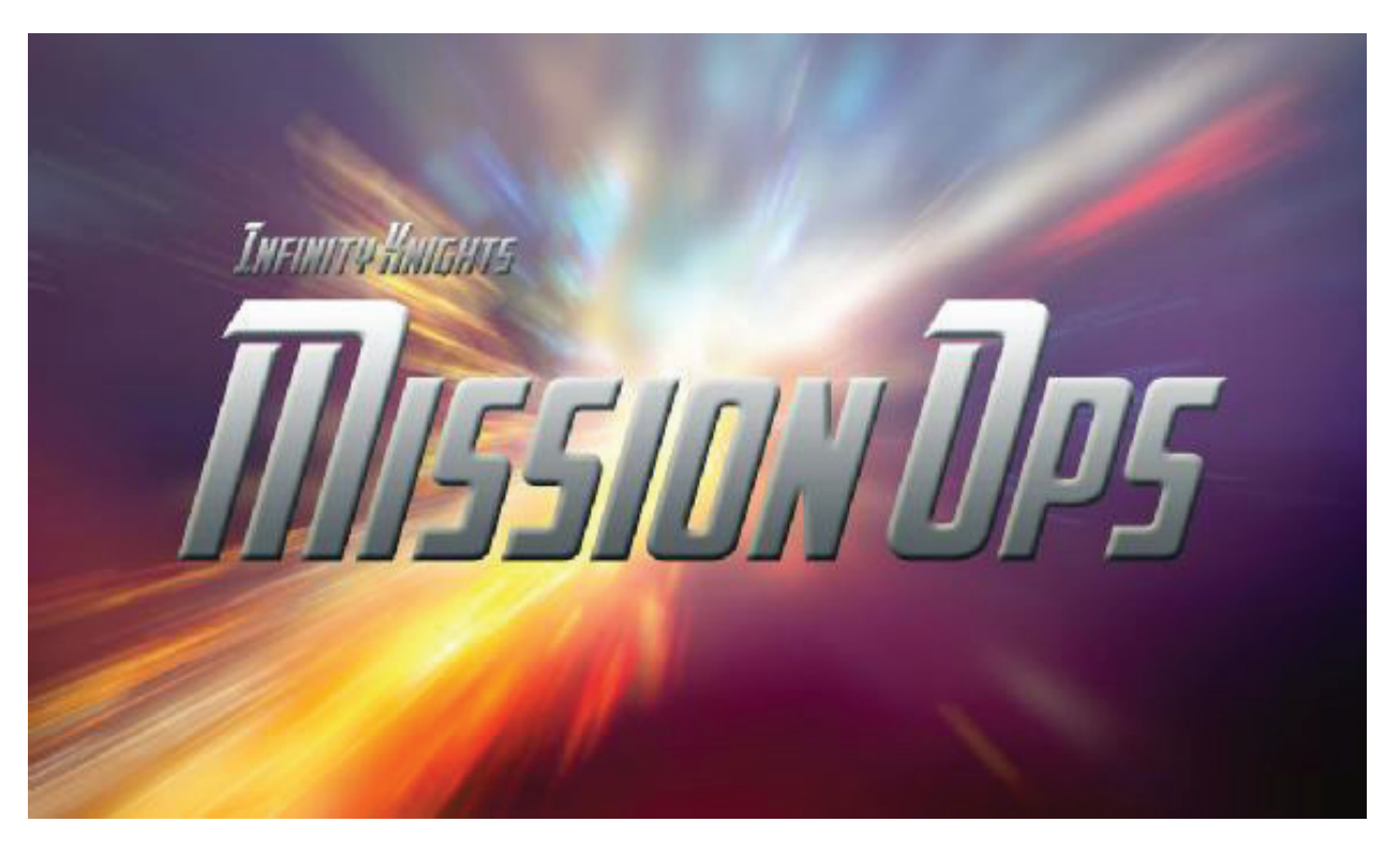
Example URL: http://www.workingexamples.org/example/show/634

Gary Gardiner, Dream Flight Adventures Sarah Gardiner, Dream Flight Adventures