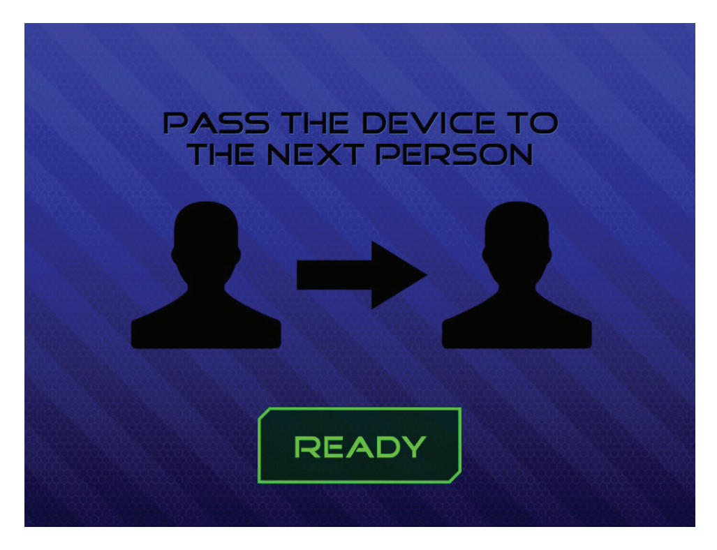
Figure 3: Sample student prompt.