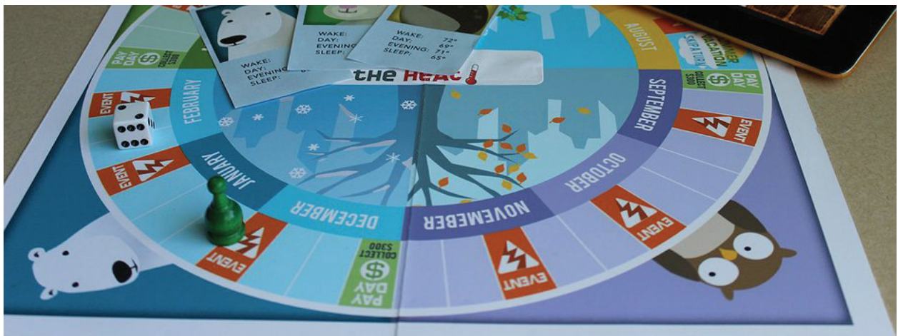
Figure 1. Turn Up the Heat is a cooperative board game in which players make tradeoffs related to comfort, energy, money, and environmental sustainability. The game incorporates a tablet computer app as a central aspect of play.

Turn Up the Heat ( tidal.northwestern.edu/greenhomegames ) is a cooperative family board game that encourages reflection on tradeoffs related to money, comfort, and environmental sustainability (Figure 1). The game playfully confronts power dynamics associated with the use of residential thermostats to control domestic heating and cooling systems. In doing so, it addresses common misconceptions about how thermostats work (Kempton, 1986) and how they can be used to save energy and money (Peffer et al., 2011). Our game incorporates traditional elements such as cards, tokens, and a game board, but it also includes a tablet computer app as a central feature of play. The app simulates heating and cooling system based on factors such as outdoor temperatures, thermostat settings, and home insulation levels. It also gives all players (parents and children alike) the opportunity to adjust a thermostat on their turn.