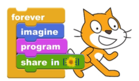
Figure 12. Logo of Scratch extension

In 2010 we made special MediaWiki extension which allowed us to insert Scratch applets in the MediaWiki website. In this first version of an extension you have to upload your scratch script on scratch.mit.edu The URL of extension is http://www.mediawiki.org/wiki/Extension:Scratch