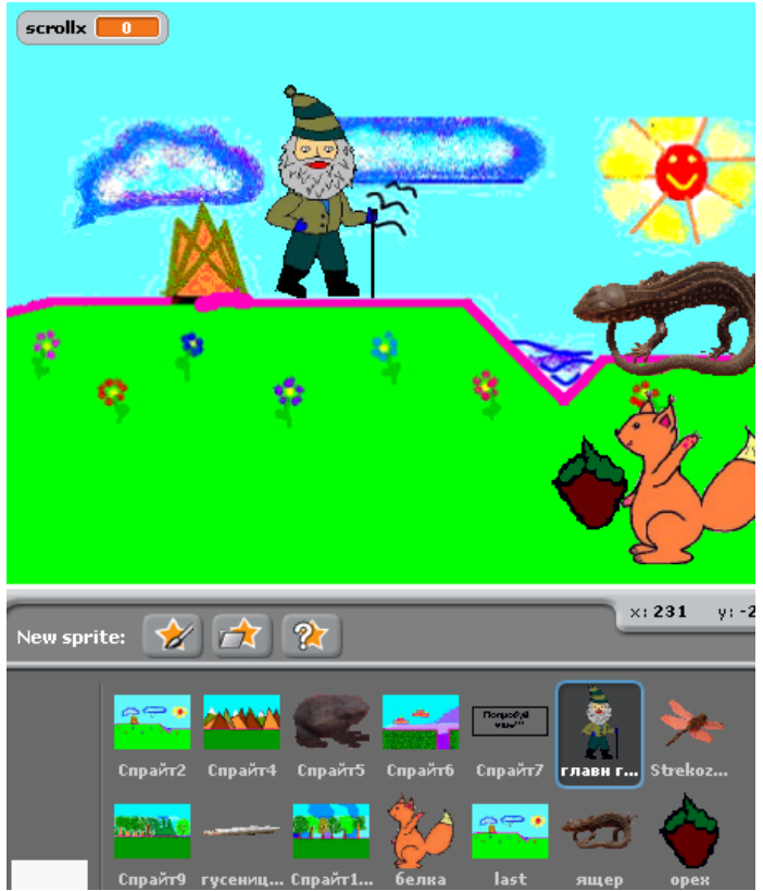
Figure 9. Strannik Project

At stage 4 all pieces of code were put together, tested, debugged and showcased as a game. This game is available on the Scratch website - http://scratch.mit.edu/projects/KatkovJuriy/652601