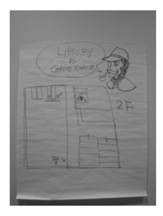
Figure 2. Thinking of the library as a three-dimensional game space.

The shift from two-dimensional to three-dimensional space was also challenging for our participants. Our project is intended to use New York City as a "game board," however in the case of the library we were restricted to using the library space itself (see Figure 2) as our three-dimensional canvas because of parental permission issues. The most successful usage of this space for game play was when youth mapped story elements from popular fiction onto different areas in the library. In this four-story space, the basement, for example, was often associated with a nefarious or illicit locale. The elevator was sometimes endowed with magical powers. Given that the usage of GPS was impossible within this setting, kids also had to make due with using QR codes as their sole link between physical and digital game space. The most successful genre of game that fit these constraints was the scavenger hunt, particularly with the added element of hiding codes where they would be difficult to find, such as under window shades, within books, or in hidden sections of bookshelves. We consider the three-dimensional games that our participants produced in the workshop a first step along the broad spectrum of three-dimensional game design—one that was particularly successful in disassociating mobile devices merely with their media consumption capabilities.