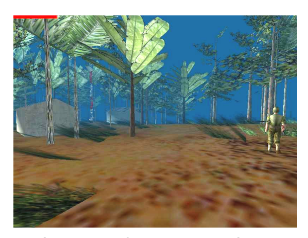
Figure 1. Screenshot of the Third World Shooter game.

Third World Shooter (see figure 1) began with several fairly lofty design goals. The history of the War of Independence is full of complex politics that could find analogy to the stalemates of the contemporary war on terror. The people seeking independence from the Portuguese colonial system were considered enemies of the state. To gain independence, the African Party for the Independence of Guinea and Cape Verde (PAIGC) used propaganda, sabotage and military action. As a Marxist group, funding and support for the liberating PAIGC often came from communist China and the then USSR. Despite the country's cold-war era allies, Cape Verde in particular has a very strong relationship with the United States.