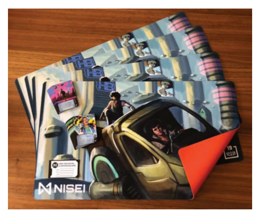
Figure 5. The 2019 NISEI Store Championship kit, with custom art playmats, alternate art cards, and a first-round "bye" for a 2019 NISEI Regionals tournament.

While NISEI can be seen as a continuation or extension of earlier ANRPC efforts, Austin's comments reinforce that they also desire to prevent ANR from reverting to becoming yet another "dead game in a box." While new card design and new rules interpretations seem to be further on down the road, multiple players and tournament organizers have expressed interest in continuing the game's tournament play as a means of continuing community engagement, and not letting monetary prizes interfere with this goal. Tournament events have historically been the centerpiece of Android: Netrunner for NISEI's interim organizers and many other players of the game, and so it should be no surprise that the first efforts to organize a future for the game has focused on continuing these activities in ways that keep