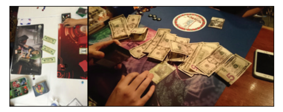
Figure 2. Two "Iruined" results from Stimhack Slack. In both, meager monetary rewards (three $20 bills, and a small pile of $1 and $5 bills) are presented.

Thus, a small contingent of very committed ANR players began to play with the very idea of money being controversial in the game, converting it to a community meme. The creation of a "sporting metagame" drove a persistent in-joke, often raised within Stimhack Slack when discussions turned to rewards, prizes, or tensions between the competitive ANR community and "casuals" who decried monetary rewards. As !ruined became ingrained within Stimhack Slack, and as Stimhack Slack overtook the Stimhack website as the central hub for discussions about the game, the meme looped back from an online meme referencing a (largely online) critique of fan-organized play, to become a physical card (created by Pagliaroni) which was distributed at ANRPC and later even at official Fantasy Flight events (see Figure 3, below).