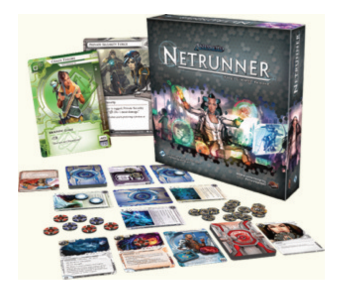
Figure 1. A promotional image of the Android: Netrunner Revised Core Set, with a display of the game's asymmetrical gameplay.

However, perhaps due to the lack of a secondary card market and without any real financial incentives to continue to collect cards and play, the excitement of the game's initial release began to dwindle over time. Fantasy Flight Games' Organized Play rewarded players for participating in tournament through promotional cards (alternate art cards), playmats, and sundry other material goods (trophies, "click trackers," deck boxes, acrylic tokens, and so on). The top prize for winning the top-level tournaments — the North American Championships, European Championships, and World Championships — was the opportunity to work with the game's design team in creating new cards which, typically, would take at least two years to see publication. Described as "the best prize in gaming" by Fantasy Flight, this was often seen cynically by ANR's community: as a means for game development labor to be passed on to successful members of the competitive community, and, alternately, as simply a reward that had no clear monetary value (unlike 10 JOHN SHARP