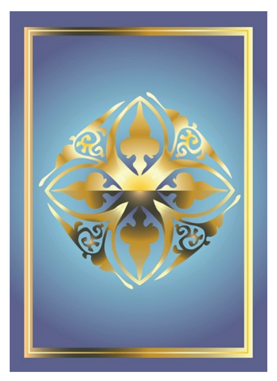
Figure 7. Back of a Heshbon card.

We carefully balanced Lost & Found so that it is possible, with optimal play, for all players to win; however, usually about half