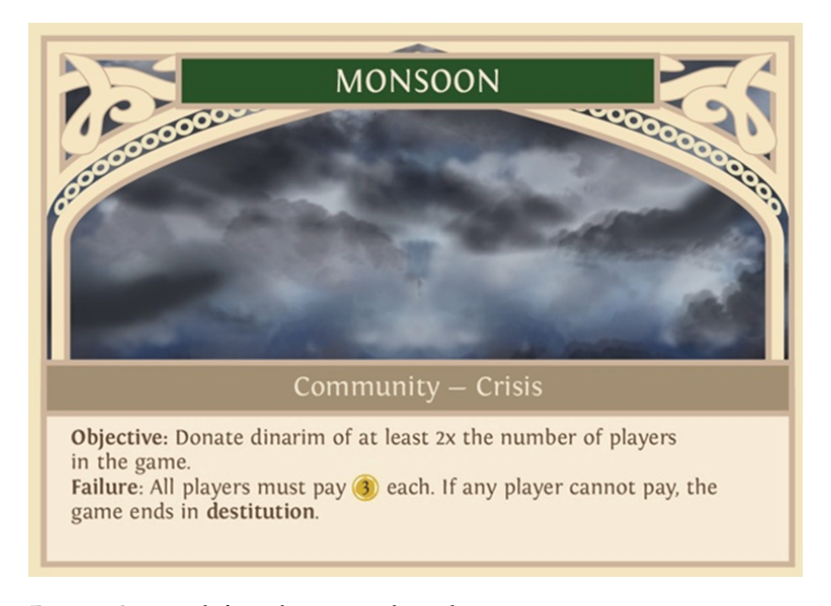
Figure 5. Crisis cards force players to work together.

Some events follow special rules. Disasters are sudden events that require an immediate response: players must collectively lose a large amount of dinarim . Crises are like disasters but allow for advance planning: they stay in play until everyone has had a turn, and then if they have not been addressed the players pay a heavy penalty for their failure to prepare (see Figure 5). In both cases, if the costs cannot be paid, the players suffer an immediate loss of game, so these are looming threats throughout the course of the game.