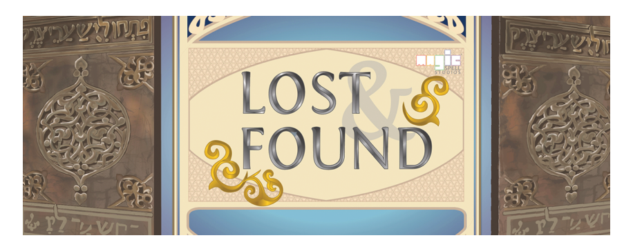
Figure 1. Background image for Lost & Found (Gottlieb, Schreiber, & Murdoch-Kitt, 2017) in its online storefront.

Lost & Found OWEN GOTTLIEB AND IAN SCHREIBER