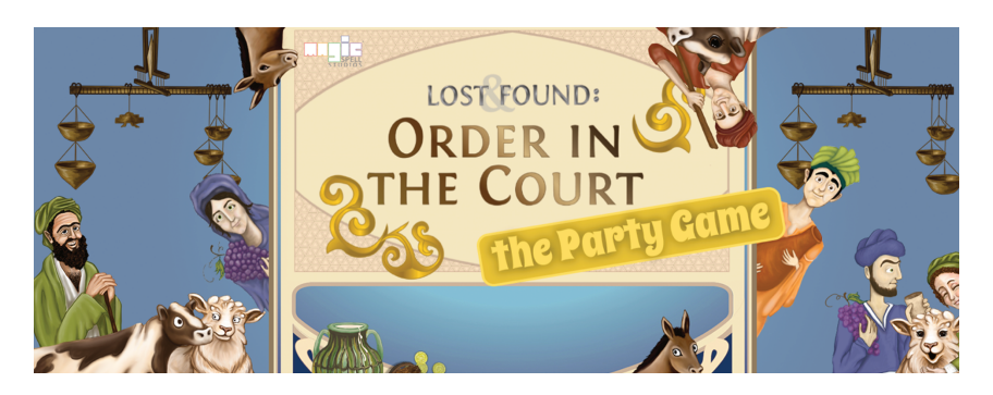
Figure 8. Background image for Order in the Court in its online storefront.

For the second game in the Lost & Found series (see Figure 8), the design team tried a different approach to mechanics. Rather than modeling real-world cases as the core mechanics to generate player behaviors of case resolution, we started with the discourse we were trying to elicit. In this case, that discourse was legal reasoning, as opposed to the simulated case decision resolution in the strategy game. Specifically, we wanted players to have low-